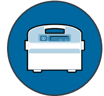
Filter indicator on power supply