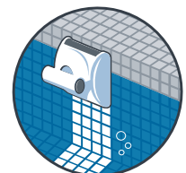
Water line cleaning