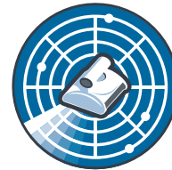
CleverClean scanning system