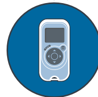
Remote control unit